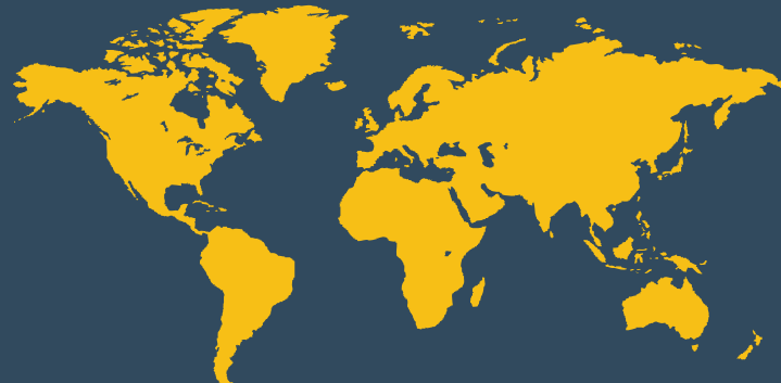
Civil Service Effectiveness (InCiSE) Index 2017. In this dashboard, we would like to share excerpts of some of the findings.

The first InCiSE results cover 31 countries and are set out in the report, The International